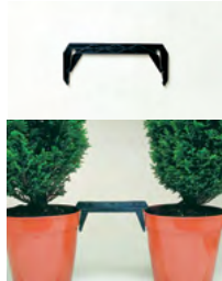
9" Support Clip